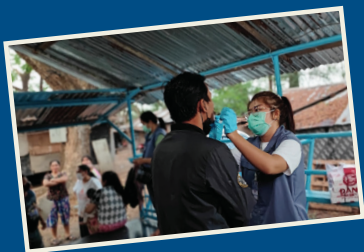
HIV&TB Community Screening