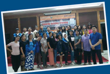
Radio DJ Training