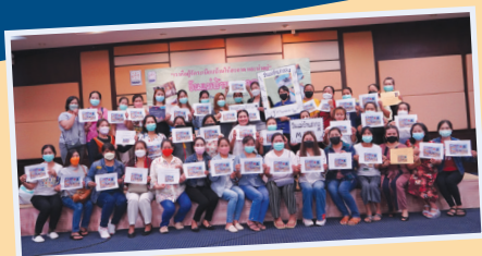
Migrant Women Leadership