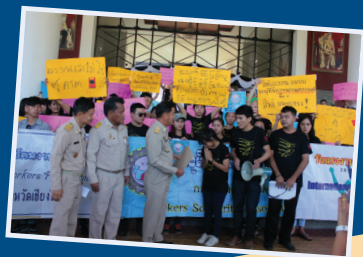
Domestic Worker's Group